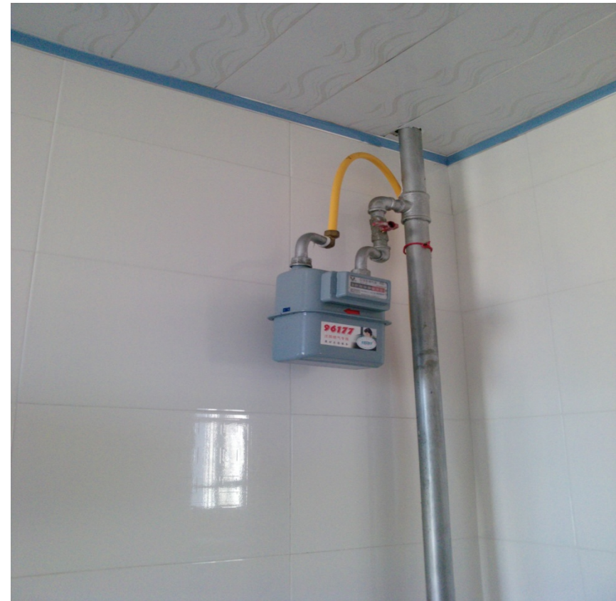
Water billing Machine